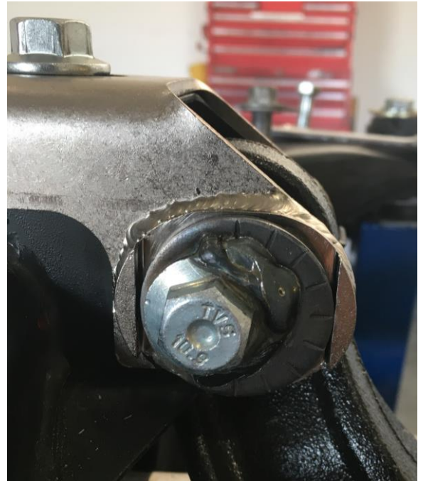
Figure 3: Steeda rear camber adjustment kit max negative camber