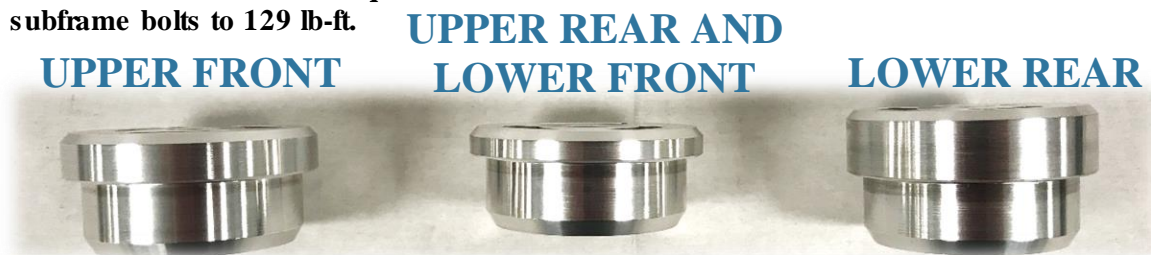
Figure 2: Steeda subframe bushings correct locations

This is a hardcore race part. NVH will be increased when installing this part.