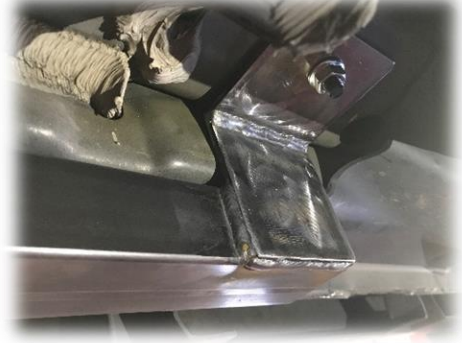
Figure 3: Steeda Fusion Jacking Rail rear bracket