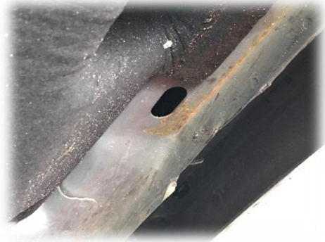
Figure 1: Front mounting hole for jacking rail

NOTE: Jacking rail powder coat is only designed to withstand vehicle jacks with padded rubber jacking plates. Surface damage can be caused using other jacks available on the market.