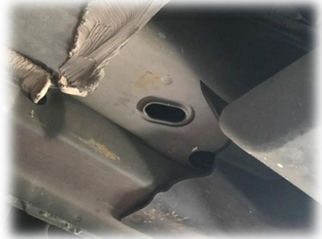
Figure 2: Rear mounting hole for jacking rail