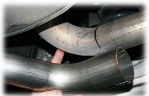
Figure 1 Mark to cut factory exhaust