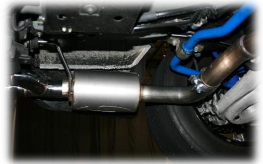
Figure 3 Steeda muffler installed