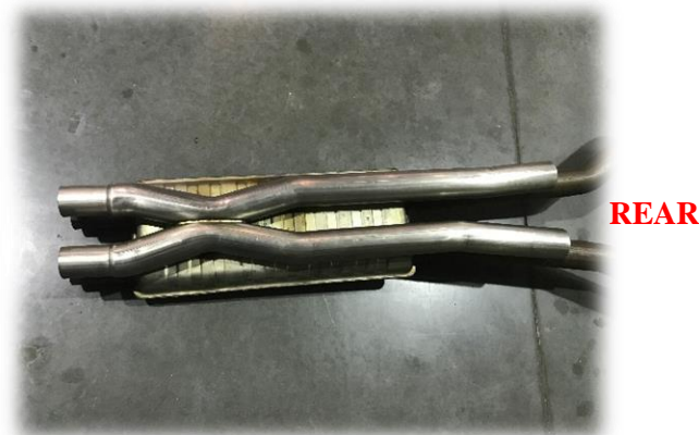
Figure 1 Steeda X-pipe on factory exhaust

Note: Two people are recommended to ensure accuracy of cut marks.